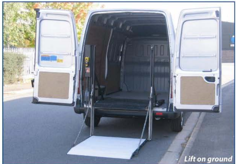
Lift on ground

Our twin column internal tailift has a lifting capacity of 300kgs and very simple to operate. The lift is ideal for lifting items such as furniture, photocopies and domestic appliances.