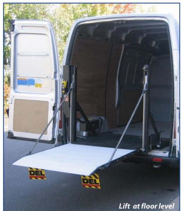
Lift at floor level