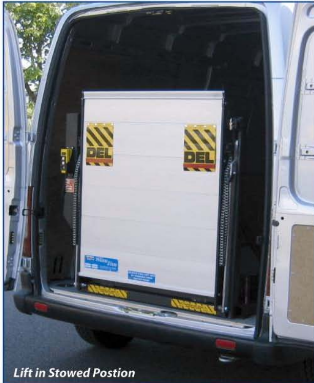
Lift in Stowed Position